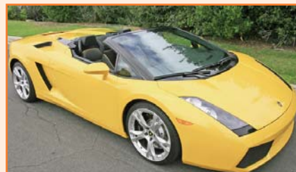
Win this Lamborghini for a day!

We like to keep things easy, so all you have to do to win this prize is to just drive on SBX! That's right - just drive on SBX between November 10-14. We'll randomly pick one lucky person who drives during those days as our winner.* ☀